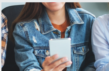
Cell Phone Protection