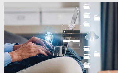
ID Theft Protection

For more visit cardinalcu.com/additional-member-services/